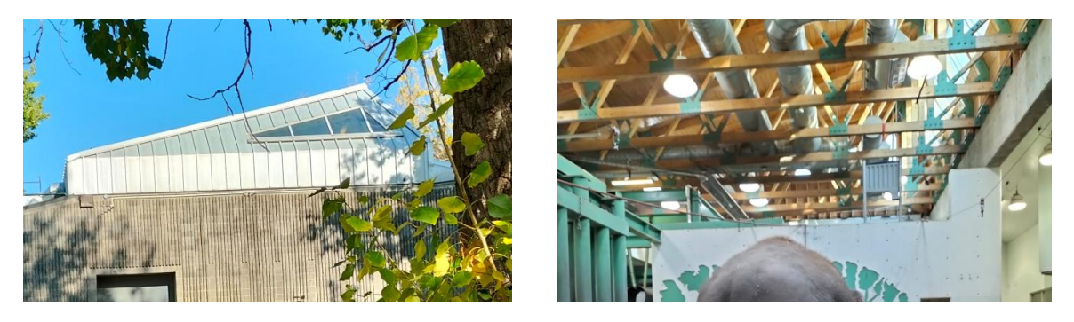
Fig. - Roof windows elephant main building

Generally, the main elephant building offers a low incidence of natural light as the entire construction only includes one row of roof windows. The construction of the tented building (dome) doesn't allow the incidence of natural light at all. Due to the lack of natural daylight, Lucy strongly depends on artificial lighting.