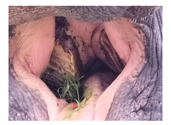
Fig. – Deformed molars

Her deformed molars don't seem to bother her when masticating fodder of diverse texture such as hay, treats or small branches. Feces contain parts of fibre (bark of branches) of remarkable length, whereby boluses also seem to be smaller in size, but in good shape (examination of fresh boluses).