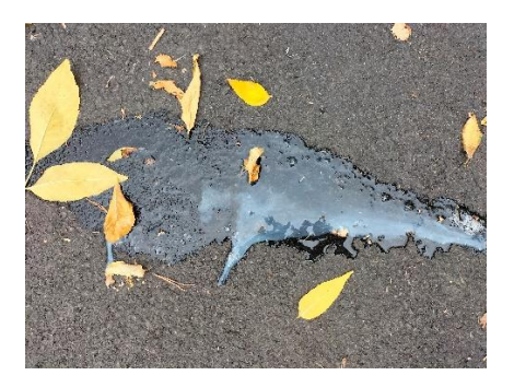
Fig. – Exudate from trunk during daily walk

In general, and her overweight and joint issues as partly responsible factors, her body shape shows some conformational abnormalities, especially regarding the positioning of her limbs and how she carries and distributes the body weight on her feet while walking or standing. In addition to her noticeable stiff walking behavior, she shows light tendencies to lean forward when in standing position, whereas during other observations she lightly leaned back (but rarely standing in a straight angle to the ground). Apart from masticatory movements, the region around her jaw area looks quite unusual, most probably related to her molar issues.