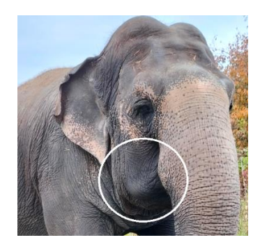
Fig. – Jaw region